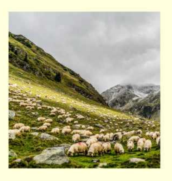
Sheep <u>graze</u>, meaning they are eating fresh grass.