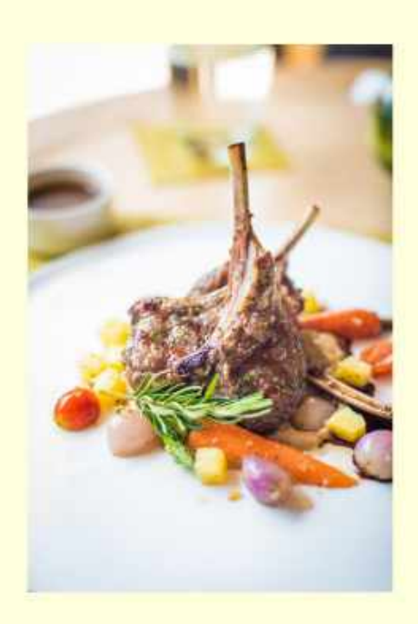
Sheep meat is known as <u>mutton.</u>