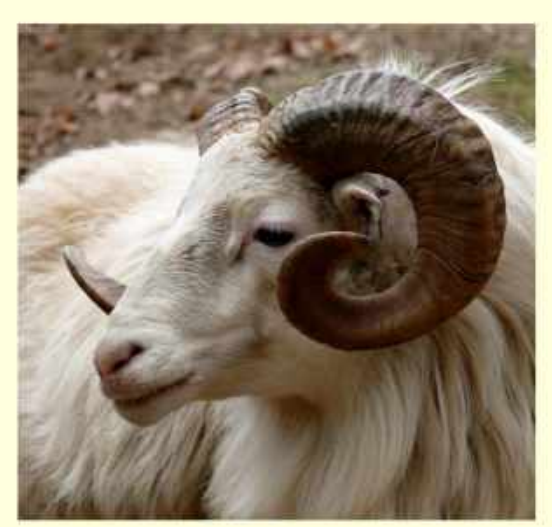
A <u>ram</u> is a male sheep.