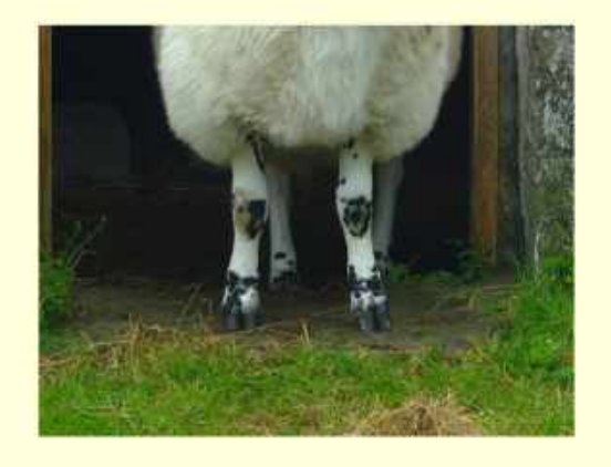
A sheep's foot is called a <u>hoof</u>.