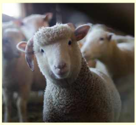
A <u>yearling</u> is a oneyear old animal. This young ram is a <u>yearling</u>.