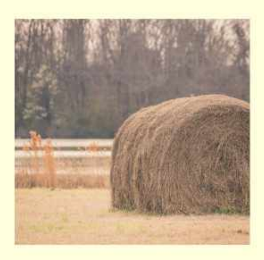
Straw is dried yellow grass that can be eaten or used as a soft bed.