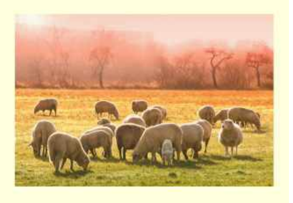
A group of sheep is called a <u>flock</u>.