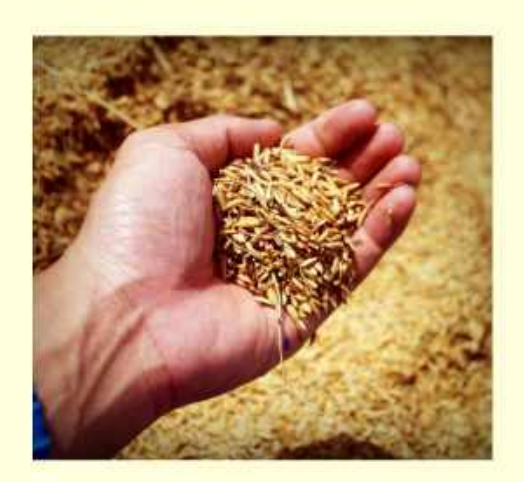
Feed made of seeds is called grain.