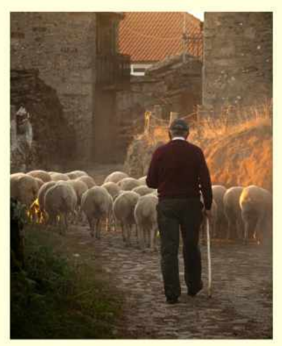
A <u>shepherd</u> is a person who guards, protects, and herds the sheep.