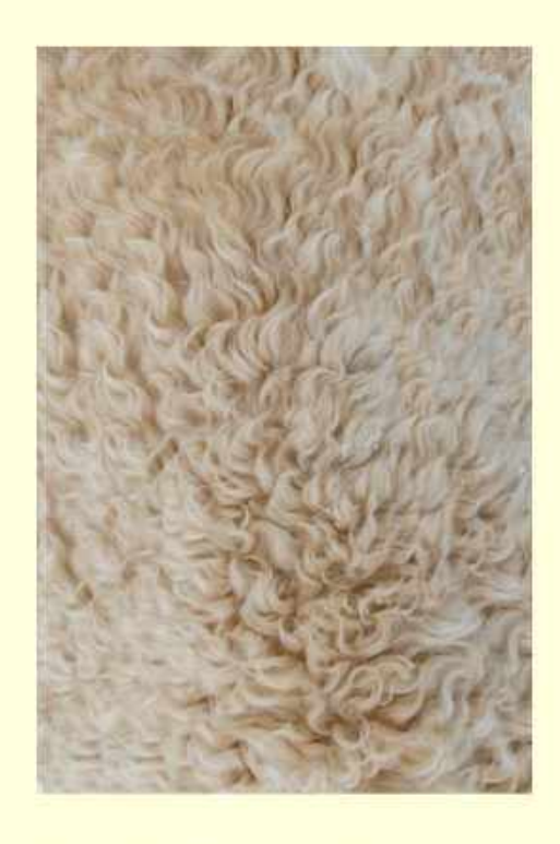
The fluffy hair found on sheep is called <u>wool</u>.